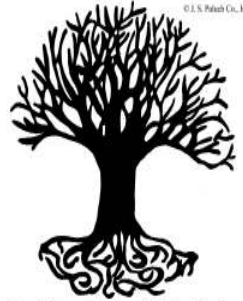
God is God of the living

No matter what age we are, all of us have one burning question we'd like to ask God. Are we wrong to ask Jesus questions? No! And neither were the Sadducees. It is helpful to ask big questions of Jesus. What matters is that we ask the right ones. Trying to trap Jesus or bargain with Him when we ask a question will get us nowhere. When we have a burning question to put to Him we probably need to remember the several occasions when Jesus said that the kingdom of heaven belongs to children (Lk 18; Mt 19; Mk 10). He may have said this knowing that children ask questions keen for an answer. It is that innocence which those of us who are children no more should try and copy. Adults often need to learn from children; to welcome them as the teachers often employed by God to reveal the kingdom of heaven. Whatever age you are, this Sunday at Mass try and identify if there's some burning question you would like Jesus to answer. Don't be afraid to ask it! Ask it in those daily conversations with Jesus which we should all make time for. Staring into the heavens, staring at the car in front, or looking outside the kitchen window, can all be moments when having asked Jesus our burning question we give him time to reply. He did answer the really long question put to him by the Sadducees. Let us give Him the opportunity to answer our questions. He still wants to be for us what his heavenly Father sent him to be: our Lord and Saviour and the Teacher of Surprises! ©